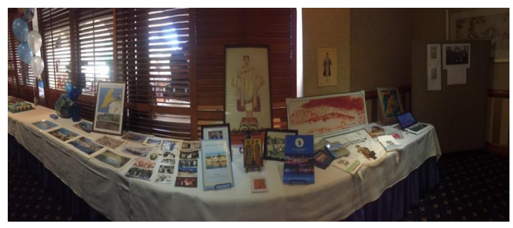
Above: Photographic Display.

association in Queensland (refer to the photograph below). It was wonderful to see so many Kazzies at the luncheon.